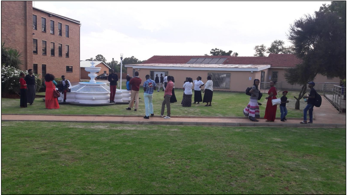
Some of the believers relaxing in the cool tranquil atmosphere that prevailed late Friday afternoon before the evening service.